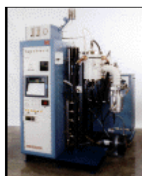
Labmaster Group 1100 Furnace